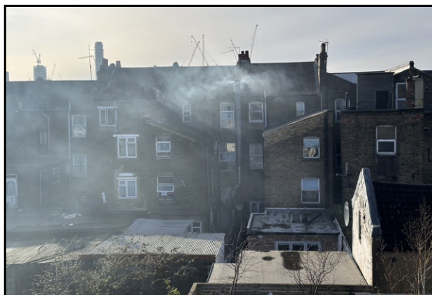
Fig 1. Smoke from Lebanese Grill during day from rear chimney

Lebanese Grill produces a continuous and heavy charcoal smoke, which lingers in the air from opening until well beyond 2 AM. Depending on the wind direction, this creates an unpleasant and intrusive atmosphere, particularly at night when residents are trying to rest. It is unreasonable to expect the local community to tolerate this level of air pollution into the early hours. Please see attached photos taken from [REDACTED]