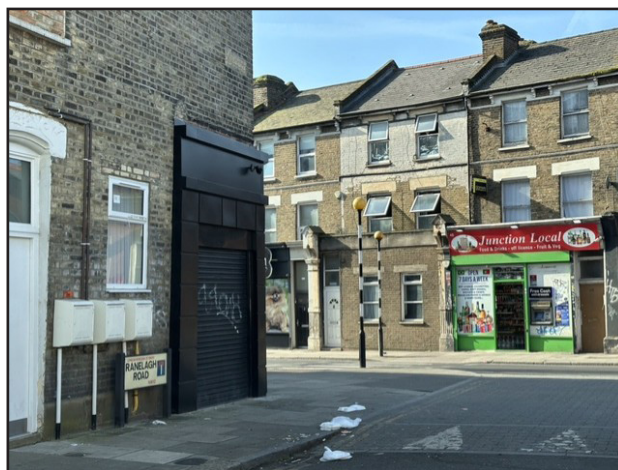
Fig 4. Ranelagh Road 4th March '25