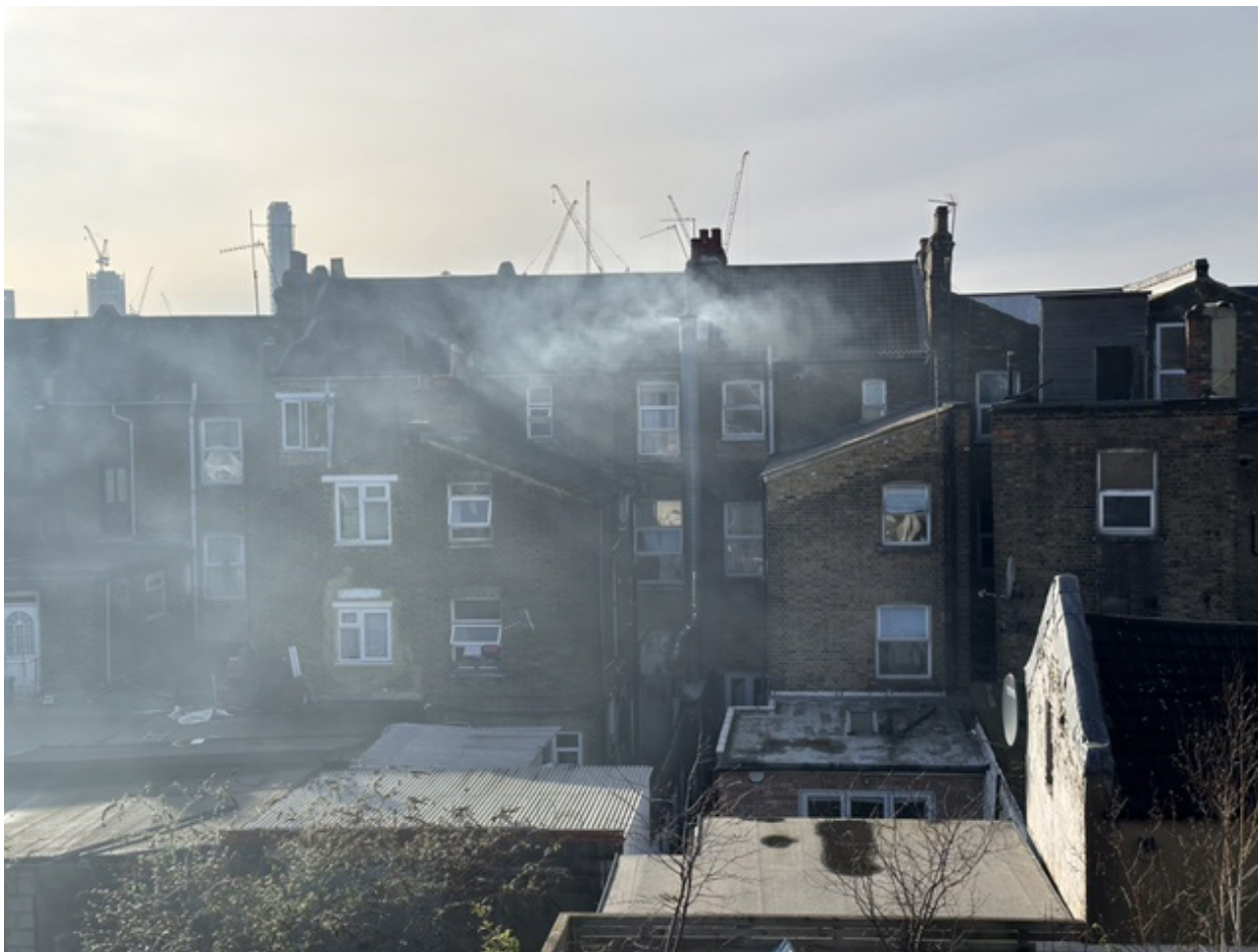
Fig 1. Smoke from Lebanese Grill at larger size for clarity