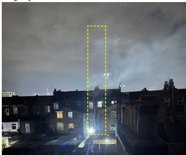
Fig 7. Light Pollution from security light 22nd Feb 2025