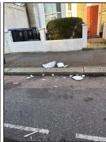
Fig 5. Ranelagh Road 4th March '25