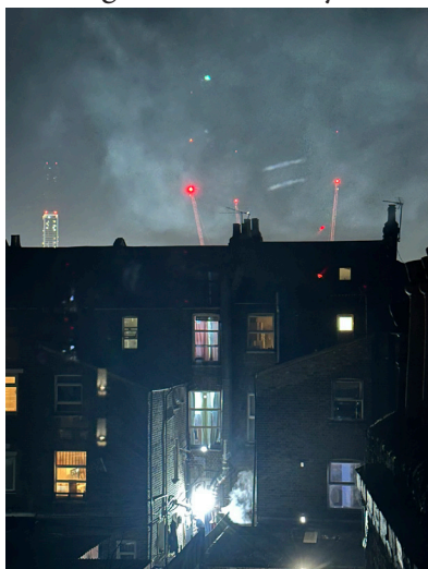
Fig 7. Light Pollution from security light

An extremely bright security light at the rear of Lebanese Grill remains switched on from early evening (4 PM in winter) until sunrise, seven days a week. This light is blinding and severely impacts nearby residents, creating an unnecessary and intrusive source of light pollution.