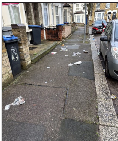
Fig 3. Ranelagh Road 24 Feb 2025

There has been a noticeable increase in rubbish in the surrounding area, including takeaway boxes, food waste, and plastic packaging discarded by customers during the night. This is particularly evident on Harley Road and the streets around Bramshill Open Space Playground, where white plastic waste is accumulating.