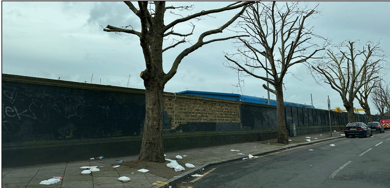
Fig 6. Takeaway boxes on Harley Road 23rd February 2025

Whilst it may be difficult to prove these takeaway boxes are from lebanese grill, there are so many of them and they are white polystyene and full of remnants of the lebanese food served there. Littering has increased markedly since it opened as people drive up onto Station Road, Harley Road and Ranelagh Road, eat in there cars then throw their rubbish out of their car window at night.